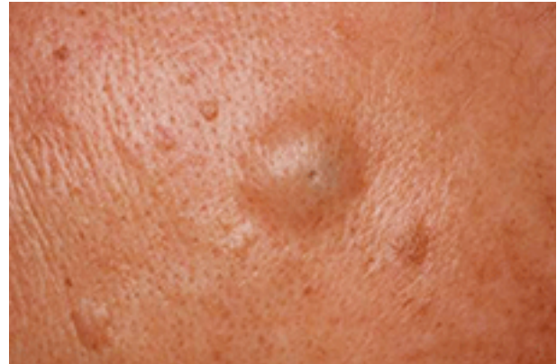
Fig. 1. Clinical feature: the tumor on the forehead.

A 68-year-old man was referred to our clinic for evaluation of multiple cysts on his left forehead, right shoulder and right back. He had a more than 10-year history of the lesions. The sizes of the tumors were 15 mm on the forehead (Fig. 1), 20 mm on the cheek and 77 mm on the shoulder. He had a past history of inflammation around the tumors. The cysts were excised under general anesthesia. Each of the cysts was composed of a mass of epithelial cells containing keratinous material. Based on results of histopathological examination, a diagnosis of epidermal cysts was made. The tumor on