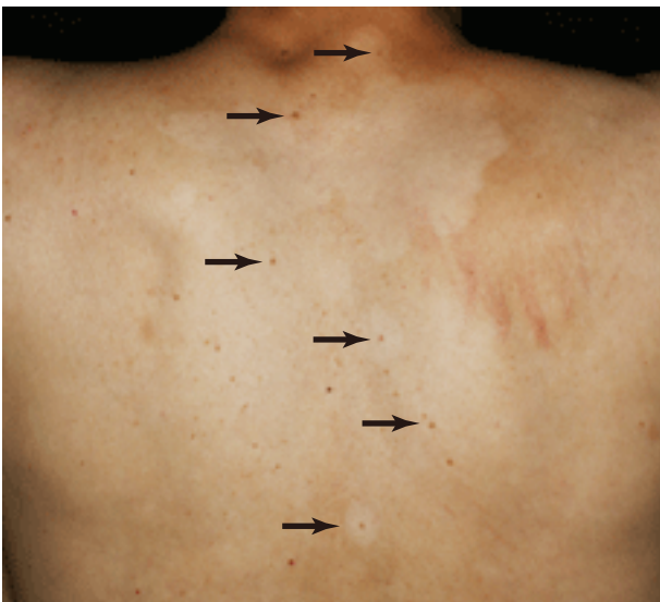
Fig. 2. Many verrucous nodules with depigmented haloes and generalized vitiligo on the upper part of the back (arrows).

There are 2 different points between our patient and previous ones (Berman, 1977); the presence of antecedent treatment and generalized vitiligo. Berman used salicylic acid-propylene glycol gel for treatment of the warts. Some topical agents, such as imiquimod and diphenylcyclopropanone, have been reported to induce depigmented vitiligo (Serrão et al., 2008; Oh et al., 2012). These agents are thought to activate host immune reactions. Although Berman confirmed that the gel did not in-