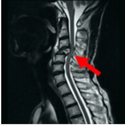
Fig. 4. Magnetic resonance imaging shows a pathological fracture in the cervical vertebrae, stricture of the vertebral canal and the oppression of the spinal nerve (arrow).